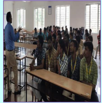
Glimpses of Student Meeting