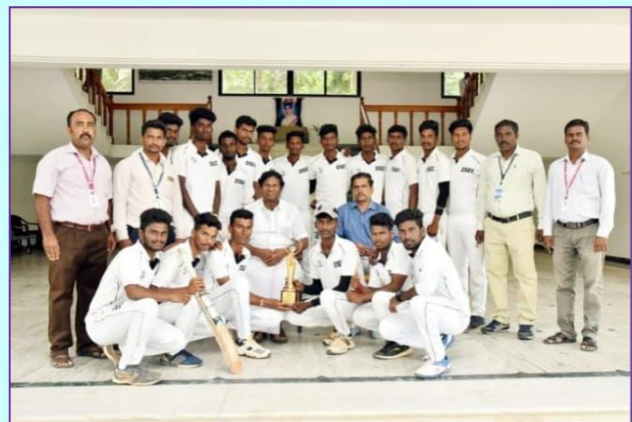
DSEC Cricket & Foot ball Team 2020 won First prize

Nearly nine students won prizes in Athletic events of Intra-College competition conducted by Anna University, Zone XIV Receiving blessings from our Honorable Chairman