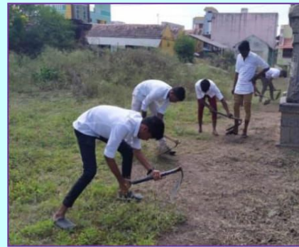
One week NSS camp at Sengunam village