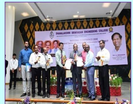
Exchange of MOU with Bluz Informatics Solutions and Syasans Career Analytics Technology Private Limited