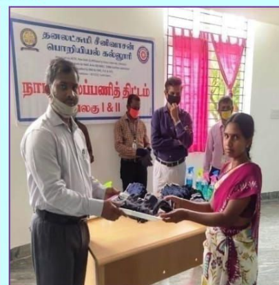
COVID 19 : Health Awareness Programme by NSS Team