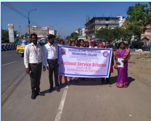
Extension Activity by I year students

✚ One day Factory visit to CHAKRA MILK PARLOUR was organized on 25th Jan 2020. Around 210 students visited the parlour . The experts in the company explained the working of instrument involved in their industrial system.