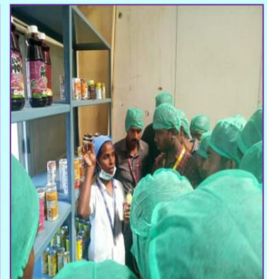
Factory Visit by the I year Students to the Chakra Milk Parlour