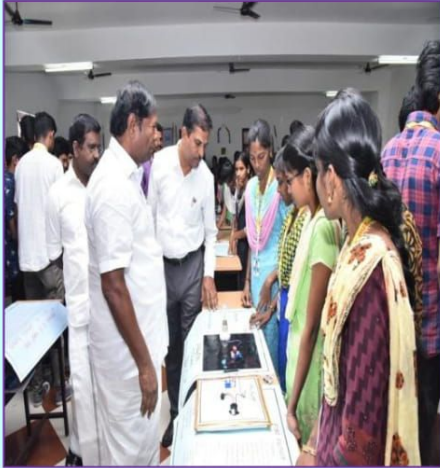
Project Expo 2020