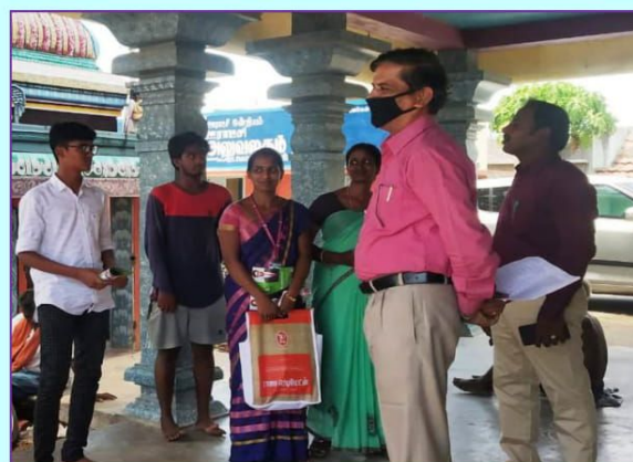
Higher Education Awareness Programme during COVID 19 Lockdown period

Let's all as a DSEC Team, work with great zeal towards more achievements in the future.