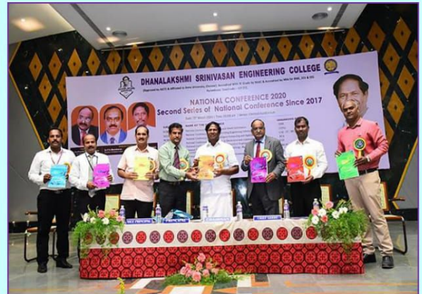
NCON 2020 : Release of Conference Proceedings