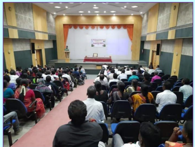
Parents' Meeting addressed by the Principal on 09.03.2020