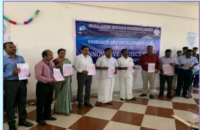
DSEC Times –19: Annual Newsletter, Vol 5 released by our Honorable Chairman

✚ The DSEC Times-19, Vol 5, an annual Newsletter comprising of the Institutional achievements, all department activities and other co-curricular activities of the students, during the year of 2019 was released by Our Honorable Chairman on January 29, 2020.