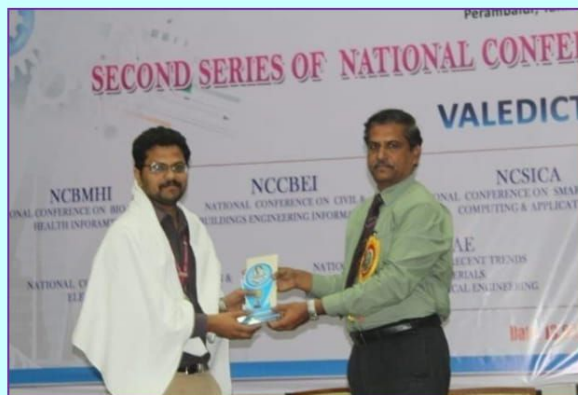
The Occasion of Faculty Appreciation

✚ One man may hit the mark another blunder; but heed not these distinctions. Only from the alliance of the one, working with and through the other, are great things born. This quote has been proved by the faculty members of DSEC by evolving the practices. The Pillars of the Practices are appreciated and conferred with memento on March 13, 2020. The Organizing secretaries of National Conference 2020 also have been cherished with the memento.