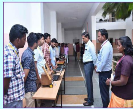
Lively archives of C3 Digno organized by Eco, Energy & Water Club