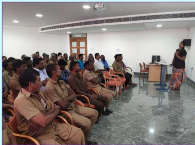
Awareness Programme on GPS to DS Institution Bus Drivers