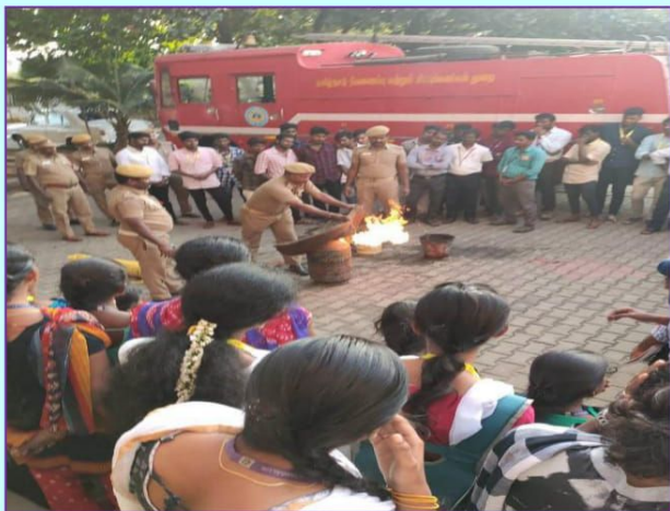
Disaster Management: An awareness talk & Demonstration