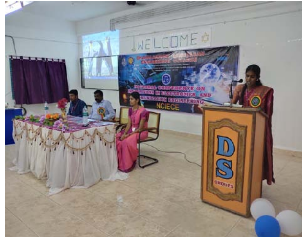
Welcome address & Overview of NCIECE 20