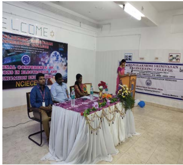
Introduction to Chief Guest