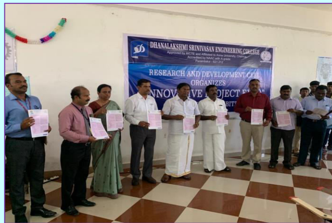
DSEC Times –19: Annual Newsletter, Vol 5 released by our Honorable Chairman

✚ The DSEC Times-19, Vol 5, an annual Newsletter comprising of the Institutional achievements, all department activities and other co-curricular activities of the students, during the year of 2019 was released by Our Honorable Chairman on January 29, 2020.