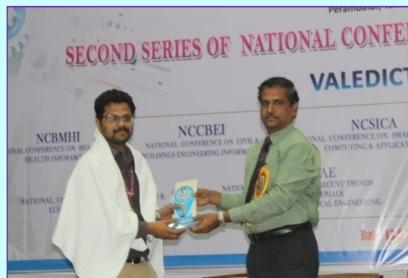
The Occasion of Faculty Appreciation

✚ One man may hit the mark another blunder; but heed not these distinctions. Only from the alliance of the one, working with and through the other, are great things born. This quote has been proved by the faculty members of DSEC by evolving the practices. The Pillars of the Practices are appreciated and conferred with memento on March 13, 2020. The Organizing secretaries of National Conference 2020 also have been cherished with the memento.