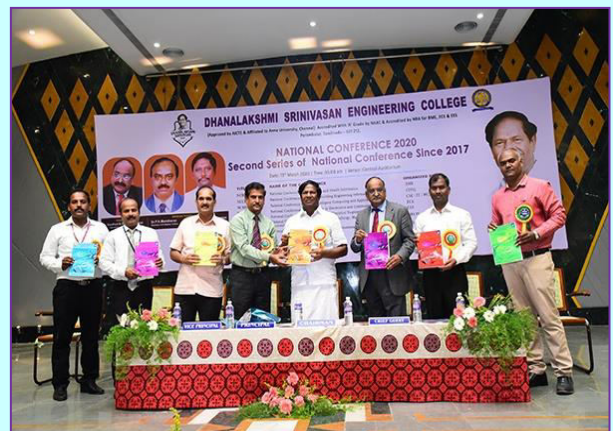
NCON 2020 : Release of Conference Proceedings