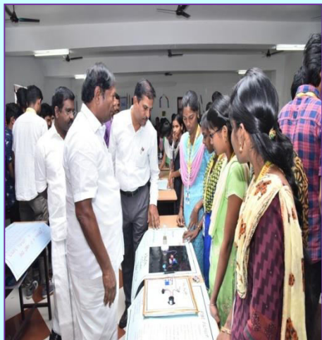
Project Expo 2020