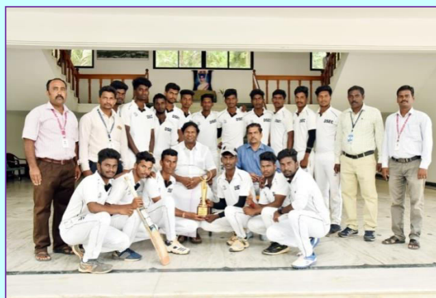
DSEC Cricket & Foot ball Team 2020 won First prize