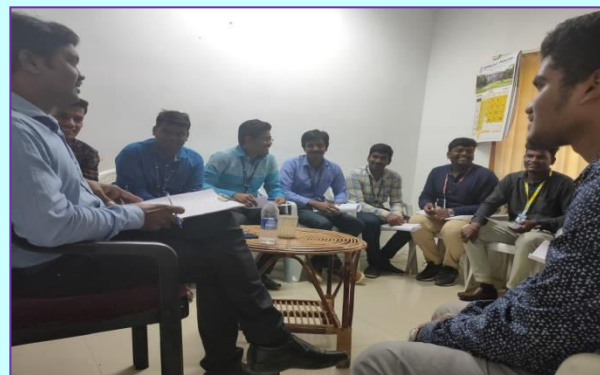
Placement 2020 Glimpses