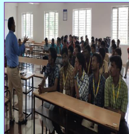
Glimpses of Student Meeting