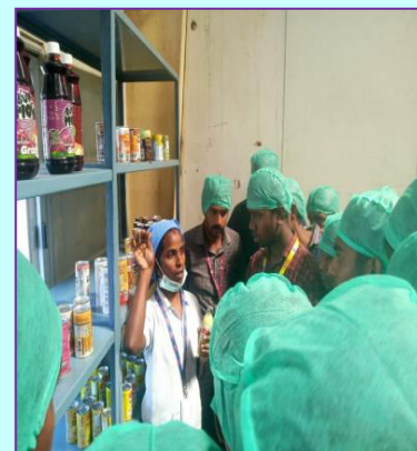
Factory Visit by the I year Students to the Chakra Milk Parlour