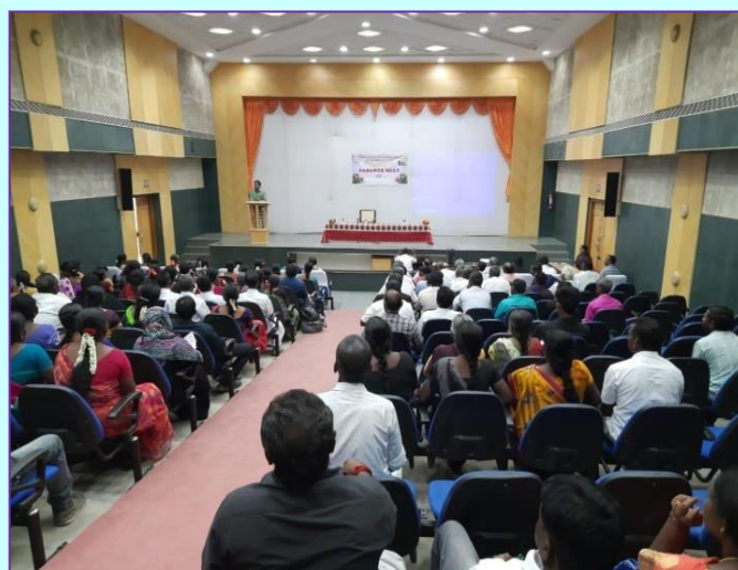
Parents' Meeting addressed by the Principal on 09.03.2020