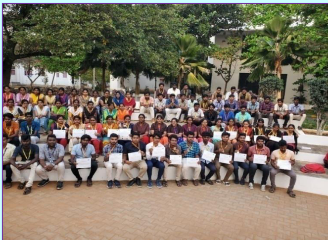
E'Club Certificate Issue Ceremony on 26 th February, 2020

An English Enrichment Session was conducted by Mr.Bharanidharan , Department of English addressed the students of DSEC on 17.2.2020. The Certificate Issue Ceremony of E Club Contest was conducted on 26.2.2020 at DSEC Lawn Area.