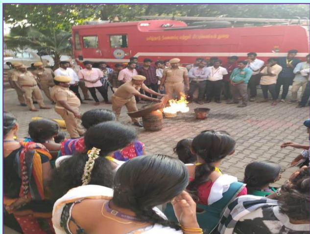
Disaster Management: An awareness talk & Demonstration