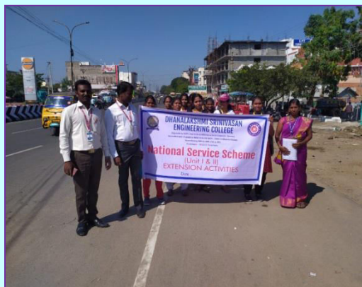
Extension Activity by I year students

✚ One day Factory visit to CHAKRA MILK PARLOUR was organized on 25th Jan 2020. Around 210 students visited the parlour . The experts in the company explained the working of instrument involved in their industrial system.