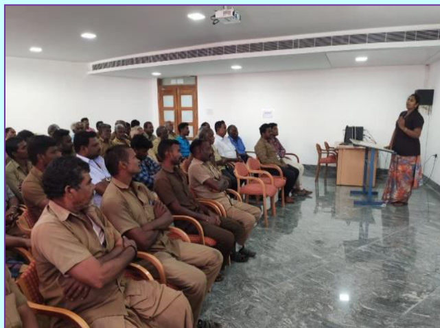
Awareness Programme on GPS to DS Institution Bus Drivers