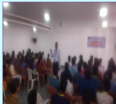
Educational Loan Awareness Programme by GRC On 18, Feburary,2020

✦ The GRC organized the Educational loan awareness program for making attentiveness about the National Scheduled Caste Finance and Development Corporation for our students on 18.02.2020 at Audio Visual room of the Central Library . Nearly 300 students were civilized with the Eligible Criteria's, Importance of Educational Loan, Terms and Conditions for applying the scholarship and documents to be submitted for availing the scholarship were discussed.