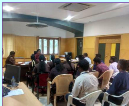
Faculty Meet on 29.02.2020

✚ In need of improving the faculty development in all aspects, the Principal addressed the faculty members as a team in way of motivating them for improving their academic skills on 29.02.2020.