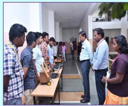
Lively archives of C3 Digno organized by Eco, Energy & Water Club