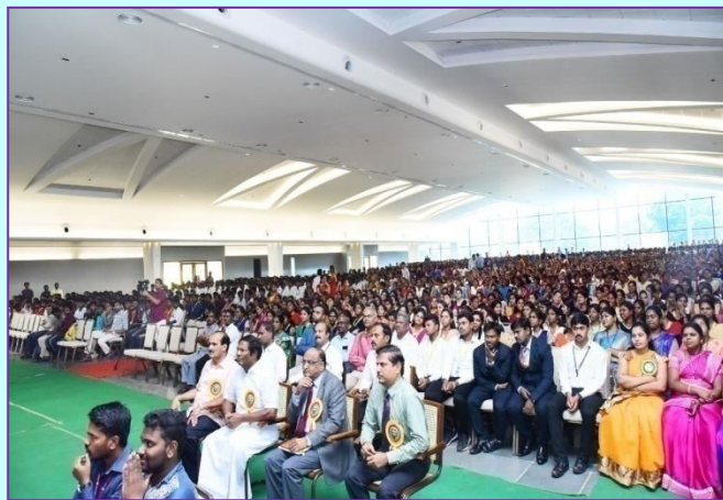
DSEC Best Practices : AV Show viewed by the DSEC'ians

✚ A handbook of “DSEC Best Practices” and AV (Audio Visuals) of the practices followed at DSEC are showcased to all the DSEC'ians on 13.3.2020. The Academicians invited visualized the AV show with pedagogic aspects and appreciated DSEC fraternity to continue the practices with motive of reaching the pinnacle.