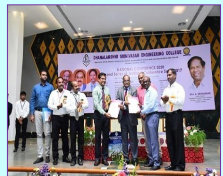
Exchange of MOU with Bluz Informatics Solutions and Syasans Career Analytics Technology Private Limited