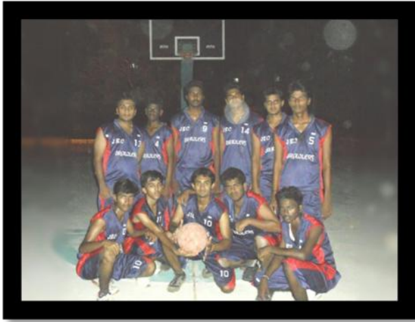
BASKET BALL TEAM [M]