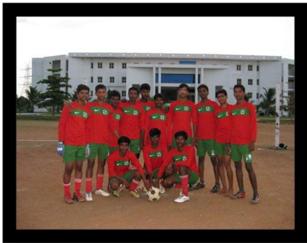
FOOT BALL TEAM