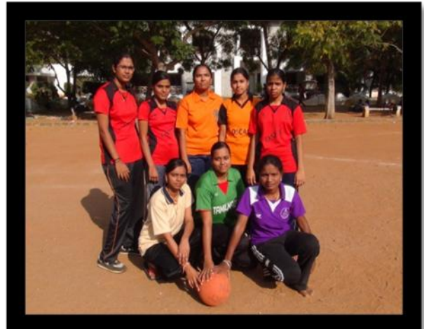
BASKET BALL TEAM [W]