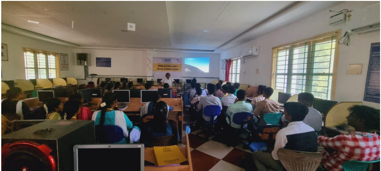
A few glimpses of the 'Financial Literacy Program' conducted by the R & D Cell, DSEC, on May 29, 2023