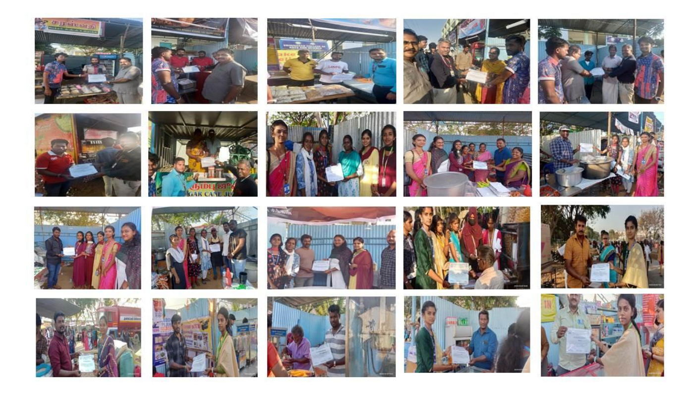
A glimpse of distribution of 'Appreciation Certificate' to the stall members