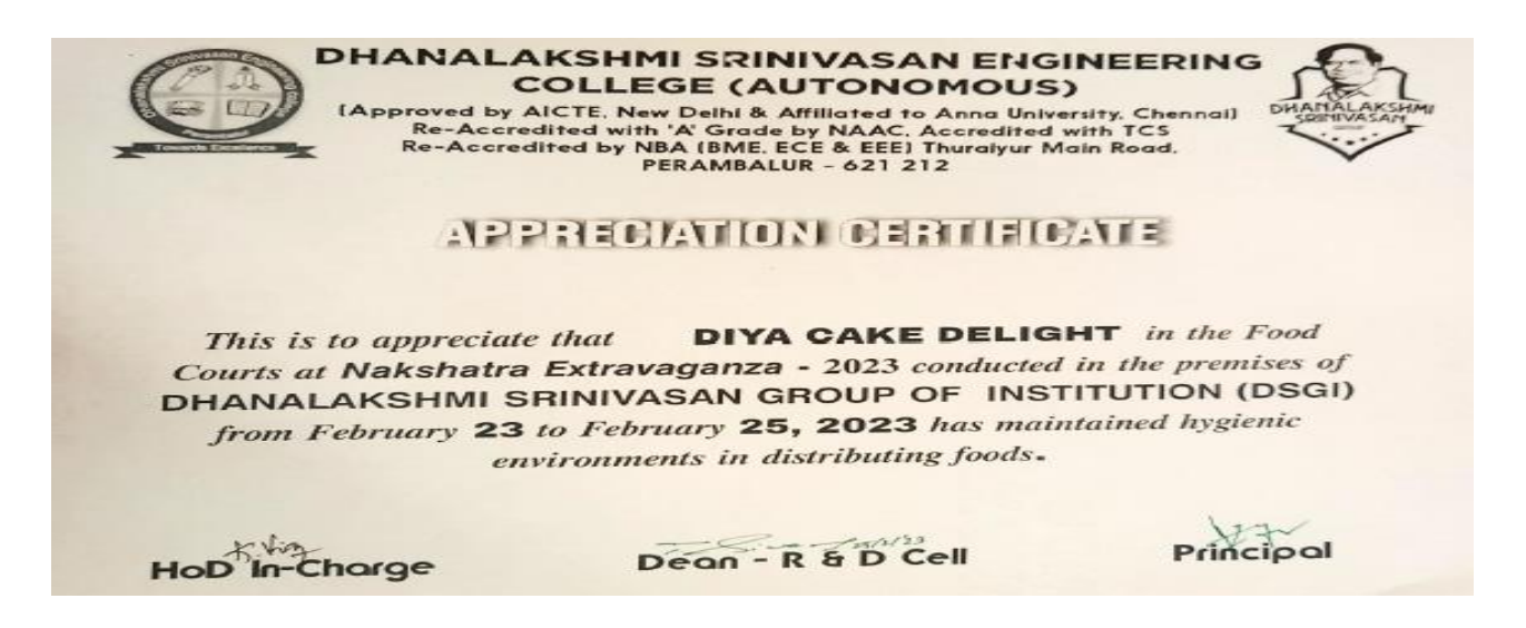
A Model 'Appreciation Certificate' distributed in the event.