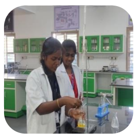
Snapshots of a few laboratory experiments