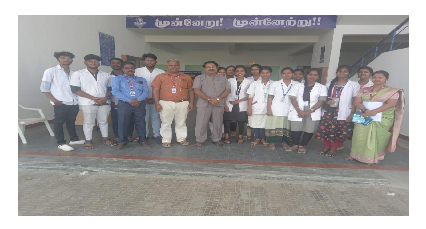
The 'Assessment Team' of DSEC